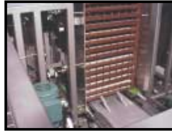
Oil Impregnated Nylon Basket Stack Transfer Roller System and Transfer Pusher for Durable and Smooth Stack Transfer